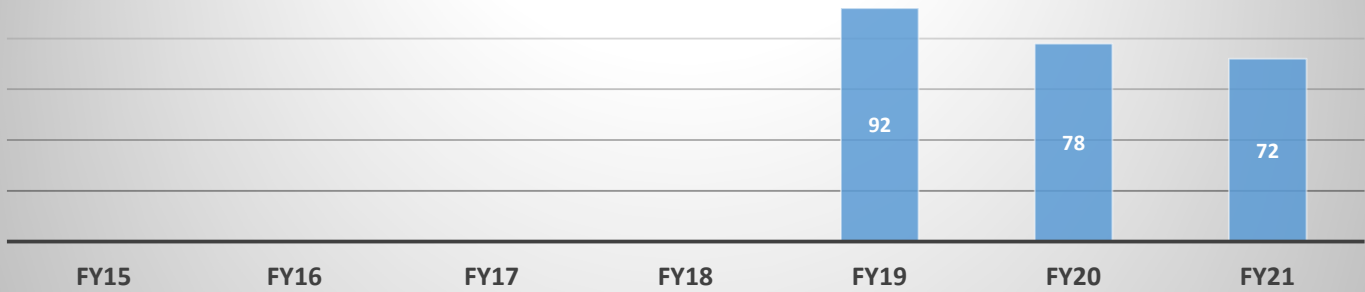
Worker Days (number of crew x days worked)