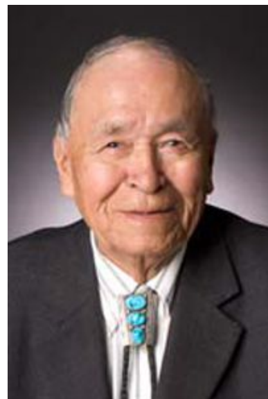
Sen. John Pinto

More details are included in the video on the Senator John Pinto Native Filmmakers Memorial Fund project page of the New Mexico Film Office.